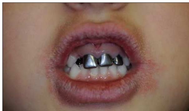
Figure 2. Upper gingival margin with inflammation and edema. Upper front teeth were covered with metal caps.