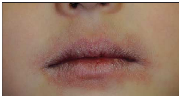
Figure 1. Well-demarcated perioral erythematous plaques with prominent scale and blurring of the vermilion border.

See jamapeds.com for the Picture of the Month Web Quiz: What is your diagnosis?