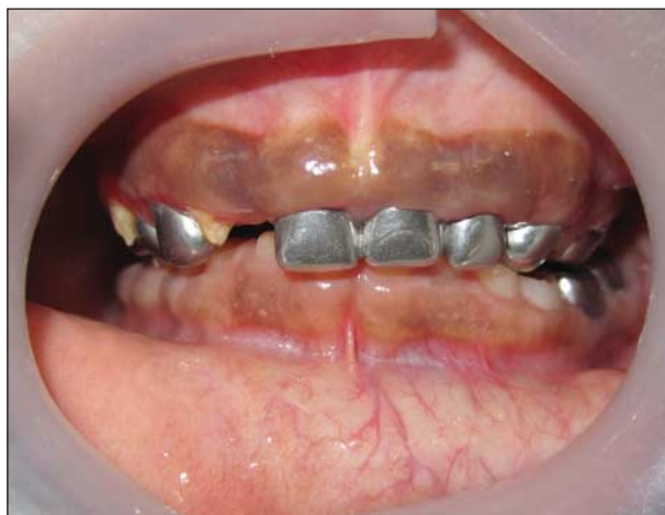
Figure 2. Photograph showing brown abnormalities of the gums of a 16-year-old girl.