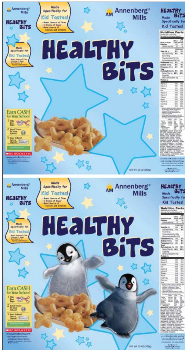
Figure 1. Copy of 2 of the separate cereal boxes shown to children, including side panels.

erature. Studies 13,16,17 reporting a negative relationship between the effect of characters and products on children focus on responses to trade characters associated with tobacco products. In addition, other studies 14,15 have tested children's liking of products and characters using characters that were initially unknown to the participants. Thus, many studies do not adequately simulate the ways in which children encounter these licensed and trade characters in their daily lives (eg, SpongeBob SquarePants on fruit snacks and Ronald McDonald for McDonald's restaurants).