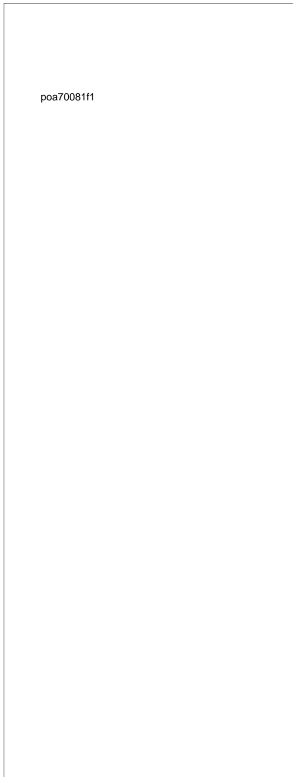
Figure 1. Prevalence of reported condom use, contraceptive pill use, and dual use of condoms and contraceptive pills at last sexual intercourse by country according to the 2002 World Health Organization Health Behaviour in School-aged Children study.

Overall, no significant differences existed by sex for reporting having used no method of contraception (boys, 13.3%; girls, 13.0%; P = .07 ). However, in some countries, the sex gap in nonuse of contraceptives was striking. For example, in Ukraine, 33.3% of girls but only 14.5% of boys reported no contraception during their last sexual intercourse ( P < .001 ). This difference between girls and boys was reversed in Canada (8.0% vs 17.5%, respectively; P = .09 ), Switzerland (2.8% vs 10.2%, respectively; P = .007 ),