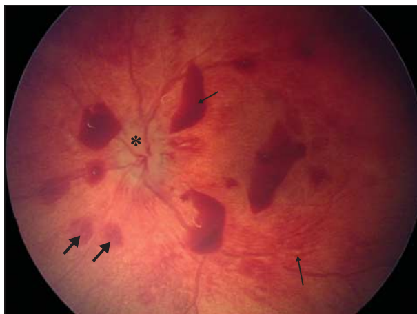
Figure 2. Posterior pole of the left eye and extending into the midperiphery of the retina (at edges of image) of an infant with abusive head trauma. Image shows optic nerve (asterisk), a preretinal hemorrhage (note how it lies over a retinal vessel) (short arrows), and flame hemorrhage with characteristic linear appearance (long arrows).

The hypothesis that increased intracranial pressure (ICP) can induce extensive retinal bleeding has recently been promulgated largely in the courtroom. 20,21 Elevated ICP is