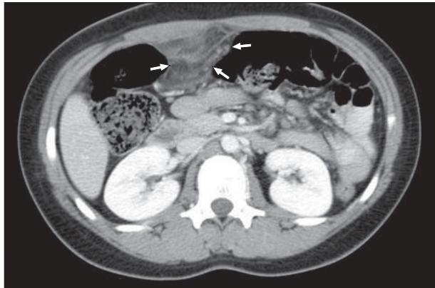
Figure 1. Axial computed tomography through the patient's upper abdomen at the level of the kidneys. Triangular area of radiodense omental fat (arrows) is seen anteriorly within the right abdomen.