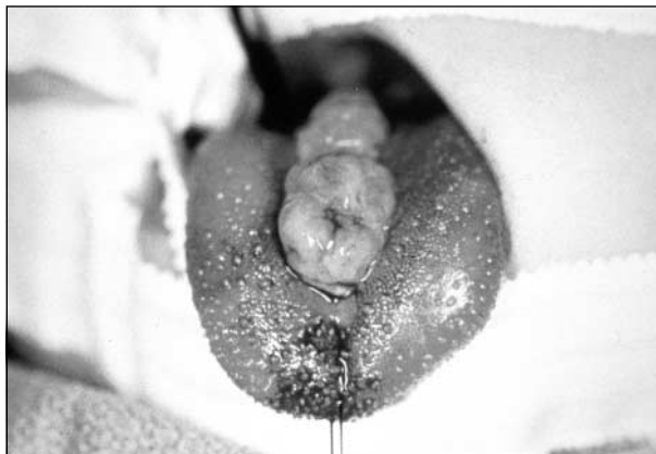
Figure 1. A 2 × 1-cm mass on the midline of the tongue.

Error in Figure Orientation. In the Pathological Case of the Month published in the September issue of the ARCHIVES (2001;155:1065-1066), Figure 1 was mistakenly presented upside down. Figure 1 is reprinted correctly here. The ARCHIVES regrets the error.